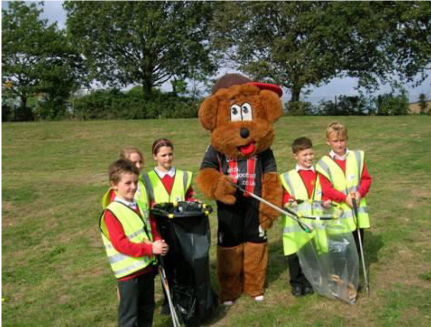
Cherry joining in with the litter pick at Elm Academy