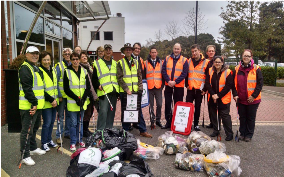
The launch of Bournemouth Litter Squad (BLS) on 9 Nov 2015